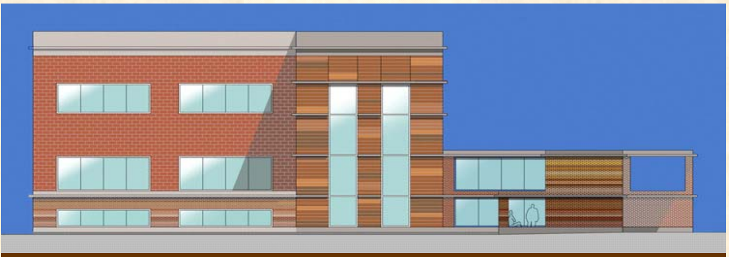
North Elevation of new building

To document our move and share other activities we have launched a blog, A Moveable Archives, brainchild of Assistant Archivist Lisa Grimm. See what's going on at amovablearchives.blogspot.com