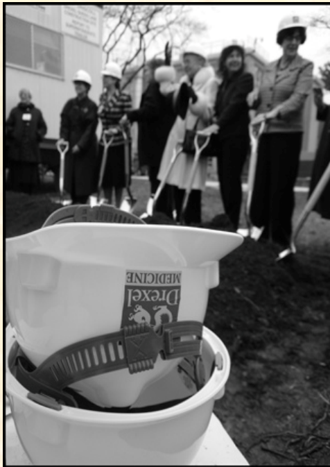
Groundbreaking, December 2008

East Falls is in the northwest part of the city, stretching from the river at the East Falls Bridge up the hill to Wissahickon Avenue. The medical school campus here expanded from the Henry Avenue site of Woman's Medical College of Pennsylvania, one of the medical school's predecessor institutions and the first degree-